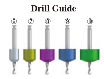
Drill: \phi 2mm Guide height: 8mm

(1) Post \phi 6mm (2) Post \phi 7.5mm (3) Post \phi 9mm (4) Post \phi 10.5mm (5) Post \phi 12mm